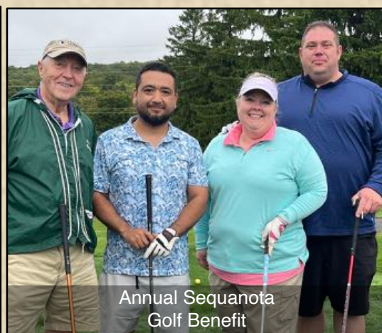
Annual Sequanota Golf Benefit