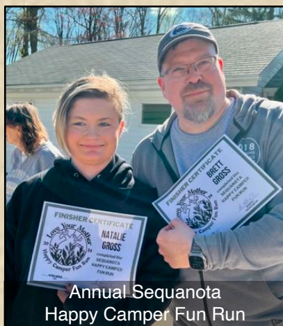
Annual Sequanota Happy Camper Fun Run